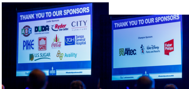
Sponsor loop graphic